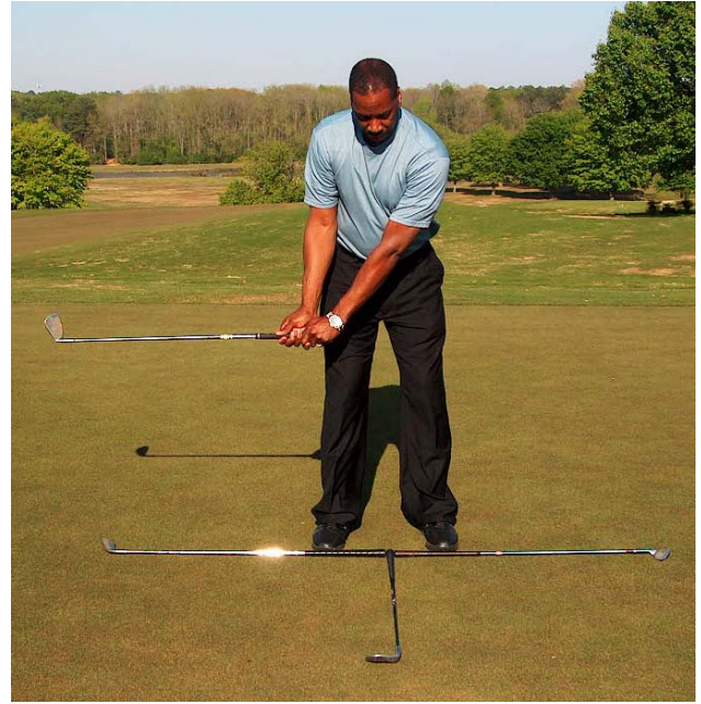
2. Open Position