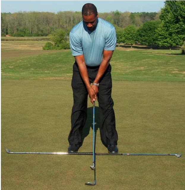
1. Start your swing from the Square Position