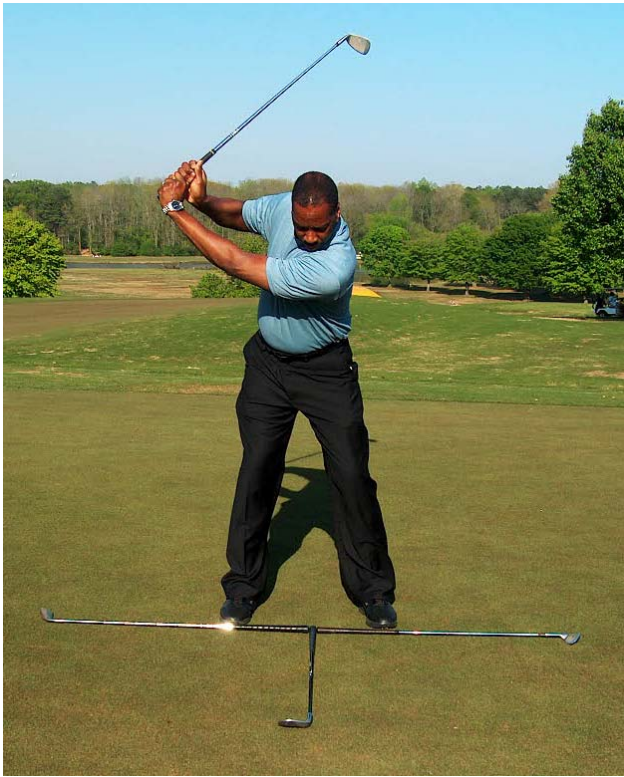
5. 10:30 Position