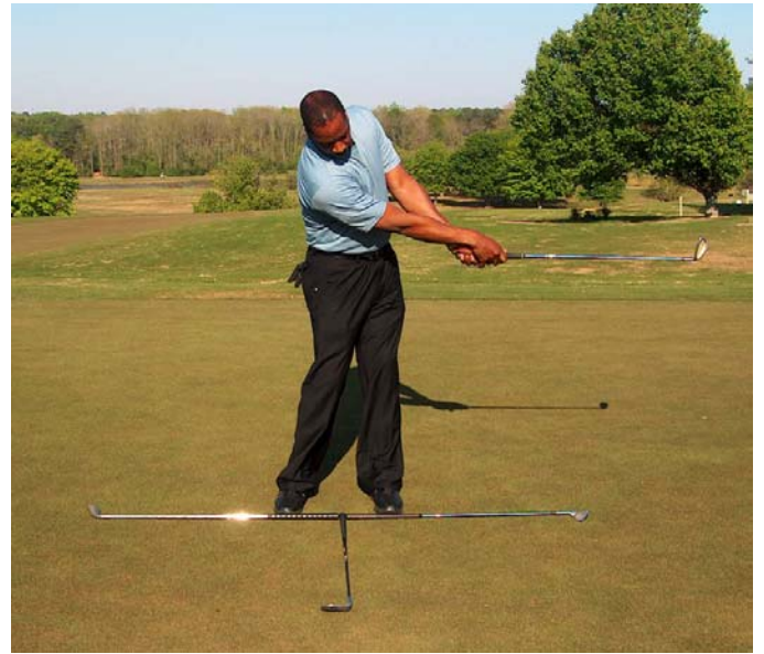
6. Closed Position