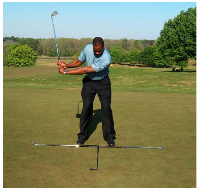
4. 9:00 Position