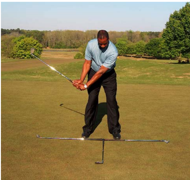
3. 7:30 Position